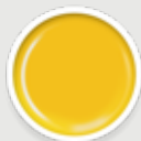
COLANEX W 112 YELLOW